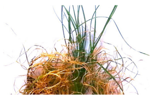
Oats grown with Biomix™