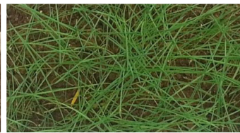
Oats with mine spoil / Biomix™

Contact us to discuss your obligation free site assessment.