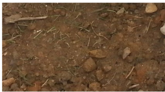
Oats with mine spoil / no amendment